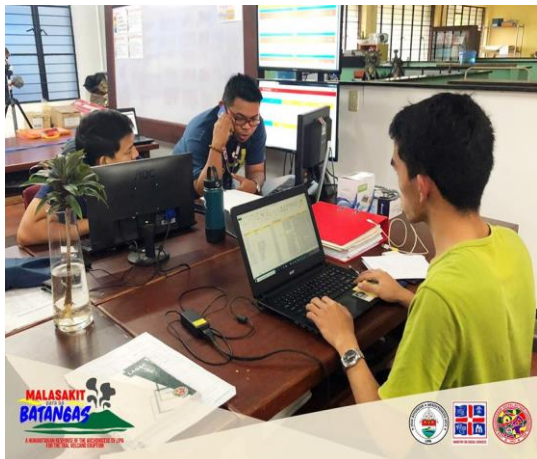
Volunteers start to call the camp managers to know the situation of their evacuation centers and evaluate their use of the new monitoring system, Info-Aid .