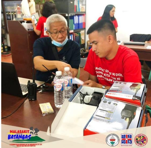
Here's the orientation of the radio units needed for a more efficient communication for #MalasakitParasaBatangas Command Center.